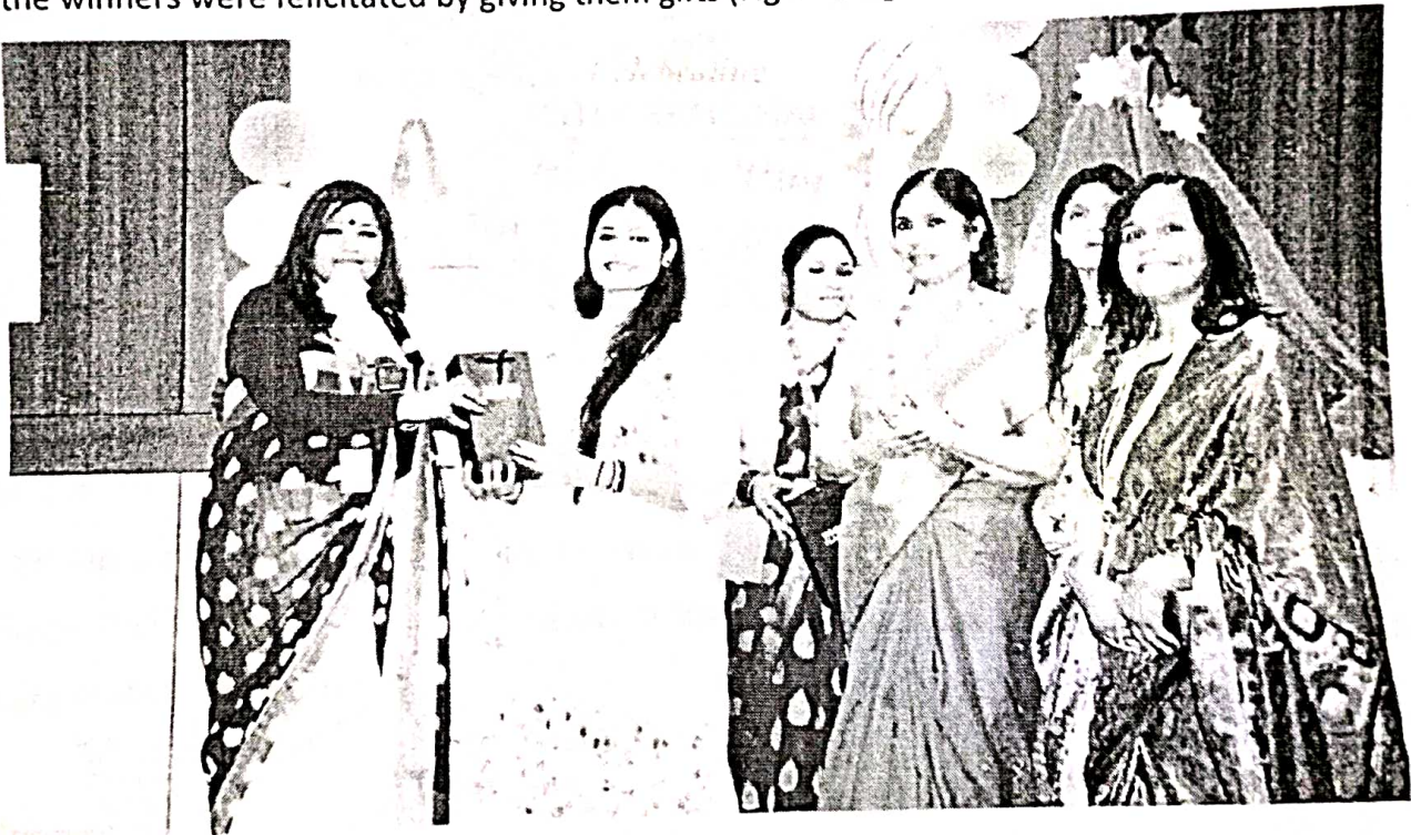
Fig. 3: Winner of fun event being felicitated

On this occasion various fun activities were also arranged for entertainment purpose and the winners were felicitated by giving them gifts (Fig. 2 & Fig. 3).