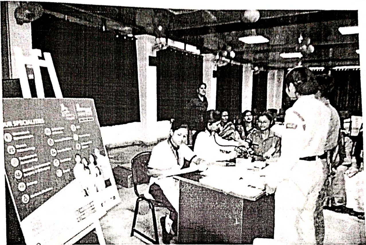
Fig. 4: Health Checkup Camp

On the other hand, NCC cadets of the college along with Usha Foundation Trust also distributed dry food and stationery to children in many slums located in nearby Kasana village. On this occasion, directors, deans, HODs and women faculty of all the colleges and many students were present.