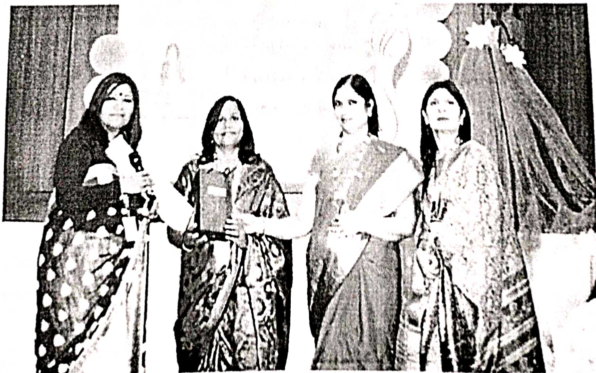
Fig. 2: Winner of fun event being felicitated